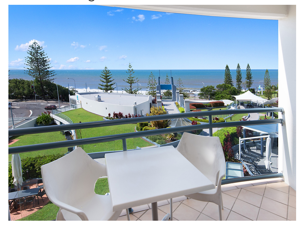
Park & Enjoy Investment

Just park your car in the secure basement car park and start to enjoy the reasons why you bought this investment property.